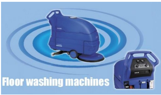
Floor washing machines

Household appliance for automatically cleaning floors, suitable for industrial use. The cleaning system consists in a rotating brush rubbing the floor. The appliance is equipped with a tank containing water and detergent, which are released on the brush when the operator presses a button.